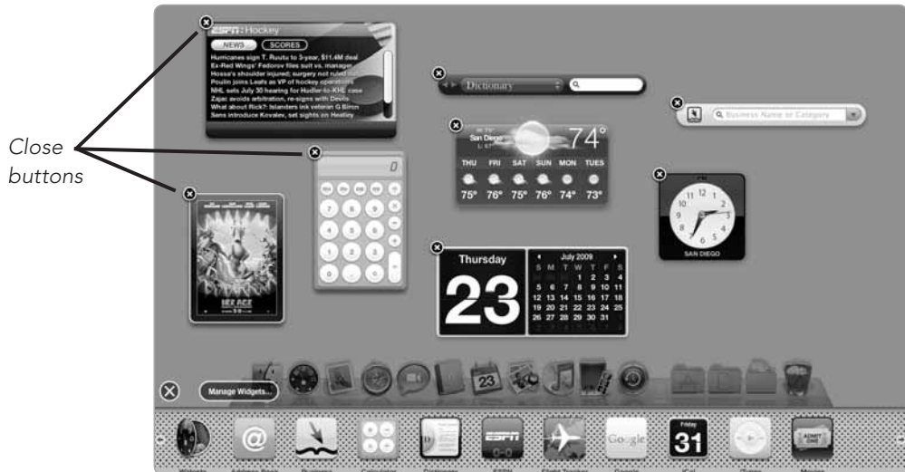
FIGURE 15-3: Clicking the plus button displays close buttons on all widgets on the screen.