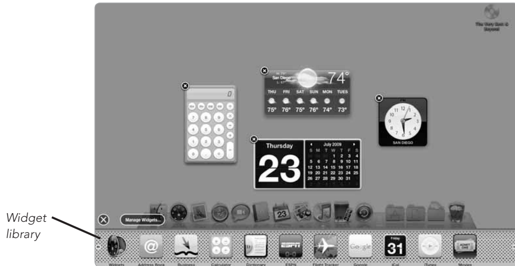
FIGURE 15-2: The Dashboard library contains additional widgets to display.