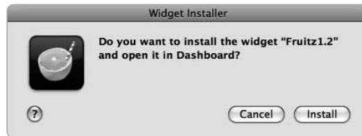
FIGURE 15-6: As soon as you've downloaded a widget, a dialog appears, asking if you want to install the widget in Dashboard.