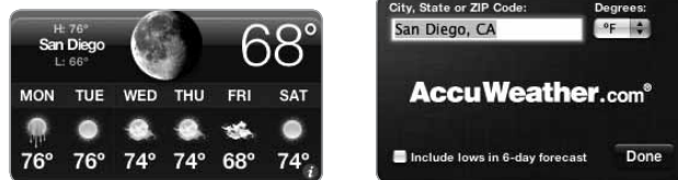
FIGURE 15-5: The backside of a widget displays options for customizing how the widget behaves.