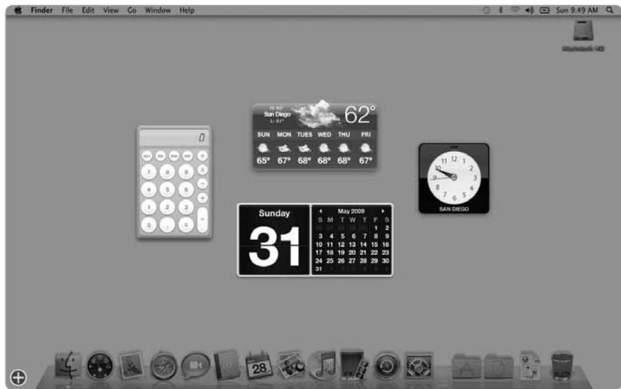
FIGURE 15-1: Every time you start Dashboard, widgets appear on the screen.

As soon as you start Dashboard, every widget currently loaded into Dashboard will appear on your screen, as shown in Figure 15-1.