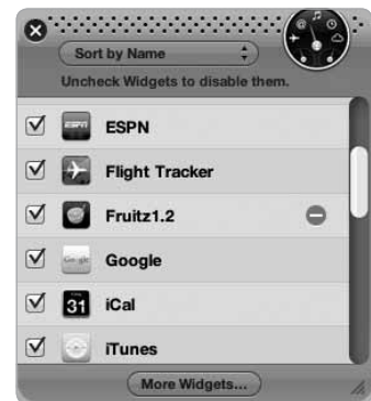
FIGURE 15-7: The Manage Widgets widget lets you erase additional widgets you may have installed.