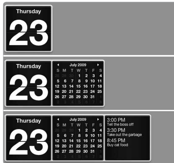
FIGURE 15-9: Clicking the iCal widget toggles the calendar appearance.

By using widgets, you'll find Dashboard handy for displaying information that you need quickly while using your Macintosh. By taking the time to customize Dashboard, you can make your Macintosh more useful and convenient than any other computer you've used in the past.