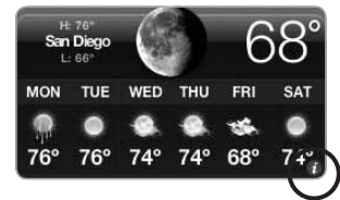
FIGURE 15-4: You can customize any widget that displays an i button in its lower-right corner.