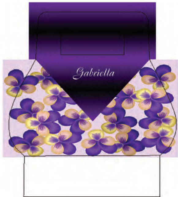
Figure 9-1: Layout for the front of the purse favor bag