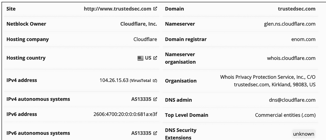
Figure 3-1: Using Netcraft to find the IP address of the server hosting a particular website

Netcraft ( https://searchdns.netcraft.com ) is a web-based tool that we can use to find the IP address of a server hosting a particular website, as shown in Figure 3-1.