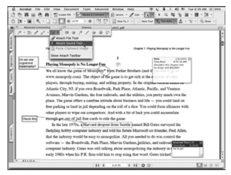
Figure 4-10: Adobe Acrobat lets reviewers mark up text for corrections, draw attention to details, add comments, and even voice opinions as well as attach files (such as background material). None of this stuff changes your original document, so you retain control.