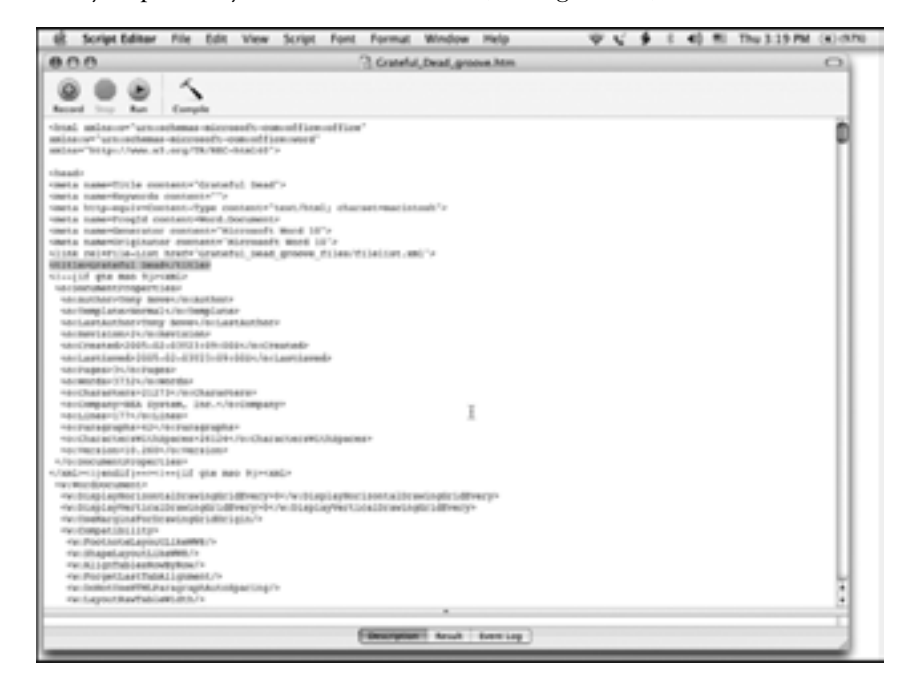
Figure 4-3: Word puts all this junk at the top of every HTML file it creates, guaranteeing that you won't know what the heck is going on inside. You can get rid of most of it and use the standard HTML codes for defining a header and title.

HTML files contain the codes for formatting web pages (and email). HTML is essentially ASCII text with formatting tags neatly separated by angle brackets from the rest of the text. Today, HTML files can contain code such as Java-Script, which hackers can use to link to other websites and embed viruses, spyware, adware, and other bad things, but plain HTML (without code) is safe. Unfortunately, Word doesn't create a plain HTML file—it adds a lot of stuff you probably won't want or need (see Figure 4-3).