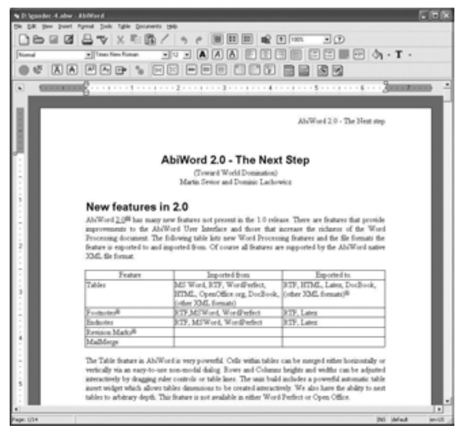
Figure 4-9: AbiWord, a free open source application, looks just like Word but uses less memory and runs on just about every type of computer system.

to be tight and fit in small memory spaces; to do this well, it separates some of the extraneous functions into plug-ins. AbiWord lets you install plug-ins such as a dictionary, a thesaurus, a Google searcher, and translators from Babelfish and FreeTranslation. Also available are AbiPaint for painting simple images and graphics, and AbiGimp for photo and image manipulation. The Google plug-in lets you search Google with your selected text.