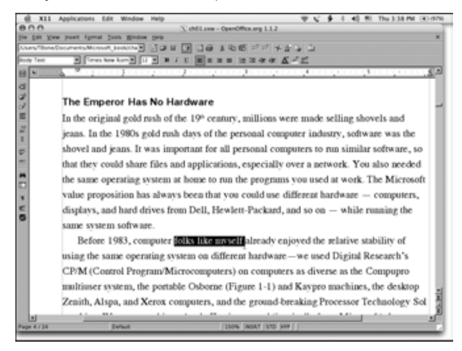
Figure 4-7: OpenOffice.org Writer looks just like Word and matches it feature for feature.

If you know Word, you can be comfortable with OOo Writer in just minutes (see Figure 4-7). OOo Writer matches Word feature for feature and even beats Word in some areas. For example, the Stylist floating palette for setting formatting styles is more convenient than Word's style catalog and extends to more than just paragraphs and characters. OOo Writer also offers text frames and lets you use styles with them, making it far easier than Word to set up multiple columns or a newsletter layout.