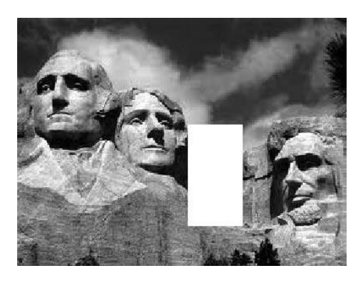
Figure 3-2: Mount Rushmore, with President Roosevelt removed

What if we merely wanted to disguise President Roosevelt's identity? We could do this by adding random noise to the picture. Here's code to do that: